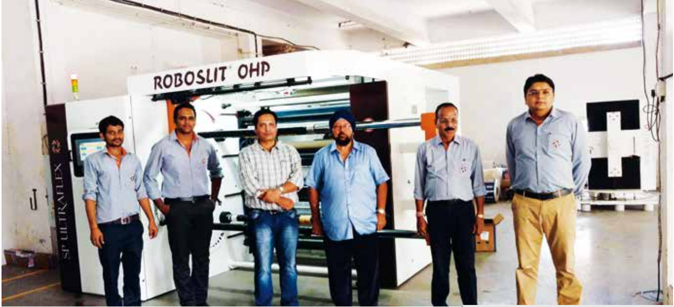
Pre-dispatch trials - GLS Films

SB Packaging of Haryana is a leading manufacturer of PE based packaging material for hygiene products. Their operating crew opted for the ROBOSLIT FSU in which the unwind and rewind sections are separated by a working platform, offering ease of cutter setting and web monitoring, which are paramount for the application. It is a challenge to slit extensible substrates like 25 micron PE at high speed and the fact that the machine can carry out this job speaks volumes about the accuracy of tension control on the machine.