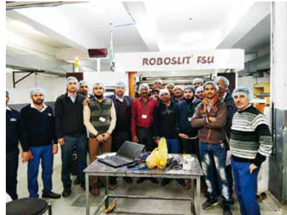
ROBOSLIT FSU commissioned at SB Packaging

Rohit Surfactants Private Limited, who has a diversified business portfolio ranging from FMCG to renewable energy to dairy products, has their in-house world class flexible packaging manufacturing units in Kanpur and Noida. In line with their philosophy of expanding with minimum increase in machine and head count, they opted for the ROBOSLIT OHP in 2017 and were happy to find a productivity differential (as compared to duplex machines) that was in line with the calculations submitted to them during technical discussions.