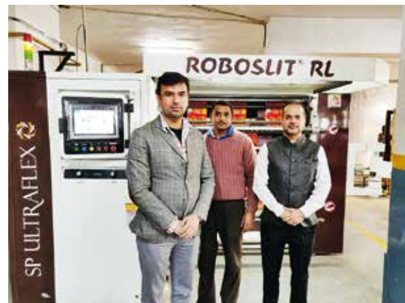
ROBOSLIT RL installed and running successfully at Sood Packagers